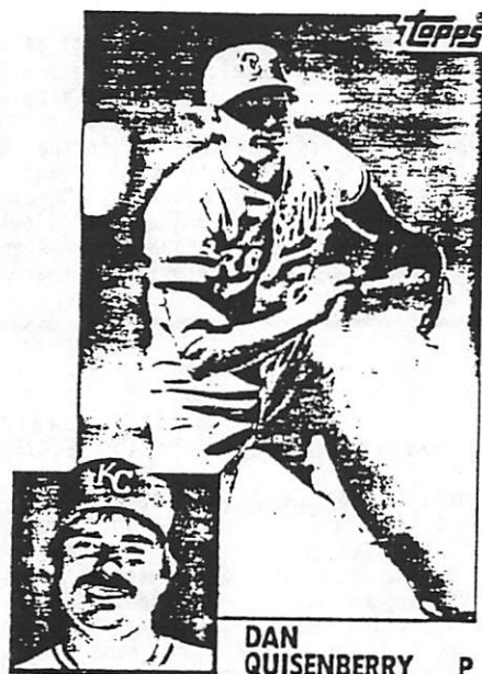
DAN QUISENBERRY P